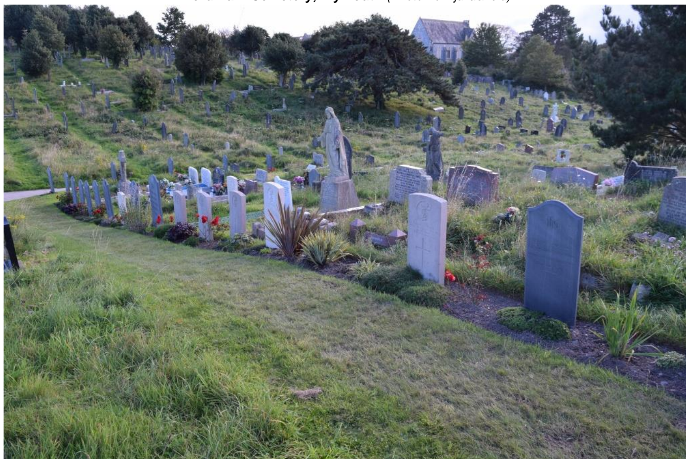
Ford Park Cemetery, Plymouth