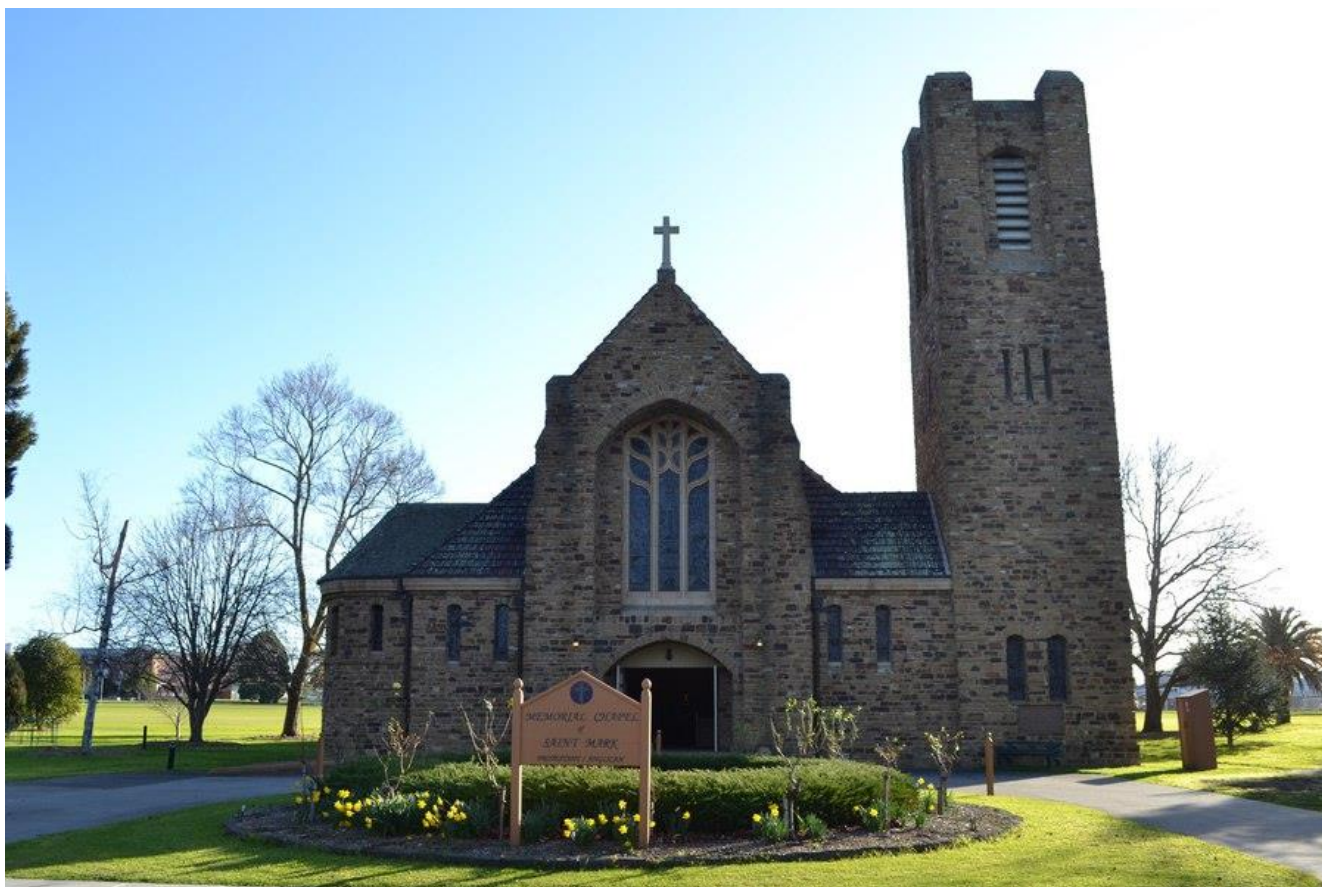
HMAS Cerberus Protestant Chapel of St Mark, Crib Point, Victoria