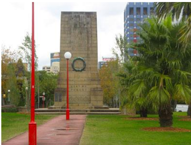
North Sydney War Memorial