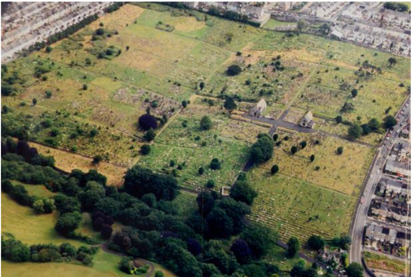
Ford Park Cemetery, Plymouth