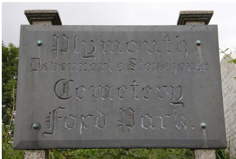
Ford Park Cemetery, Plymouth

Ford Park Cemetery (formerly known as Pennycomequick or Plymouth Old Cemetery) contains 769 burials of the First World War, more than 200 of them in a naval plot, the rest scattered throughout the cemetery. All of the 198 Second World War burials are scattered, 1 of which is an unidentified airman of the Royal Air Force. There are a further 4 Foreign National and 1 non world war service burials here. (Information from CWGC)